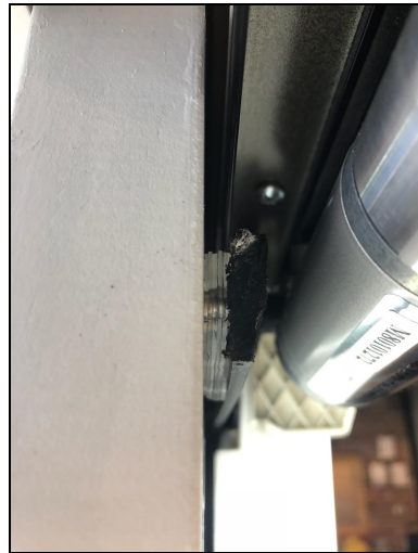
Track & Plastic Spacer/Shim Closeup