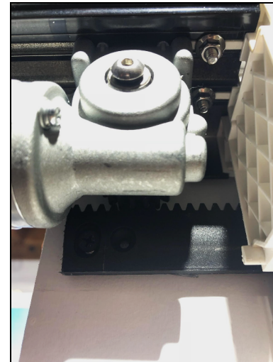
Motor/Track Meet Closeup