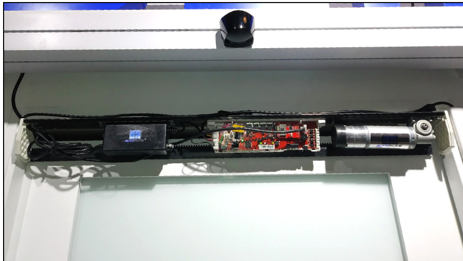
MultiDrive Unit mounted on Pocket Door with Slim Tracks (note the same mounting method applies to Standard or Elite units)

The AutoSlide can usually be mounted on a pocket door frame in two ways (depicted in the below diagrams). The left diagram depicts the standard mounting method, mounting over the sliding panel (clear opening). This method is shown in the pictures on this sheet. The right method of floor mounting is usually a last resort and is only recommended if another method isn't an option.